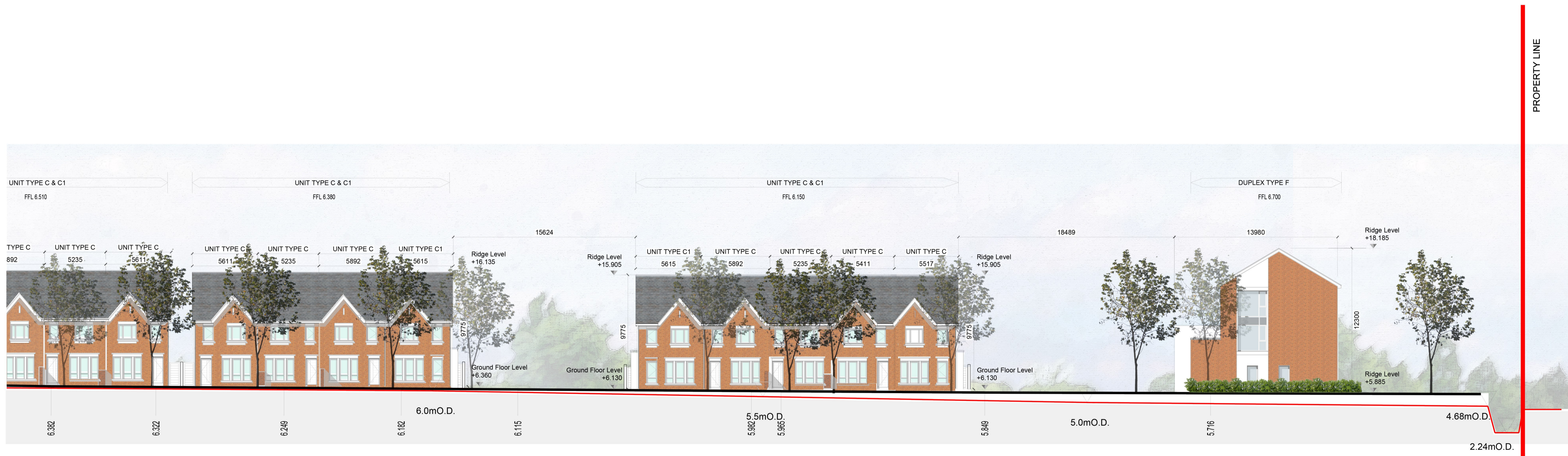
Context Elevation BB (CONTINUED)